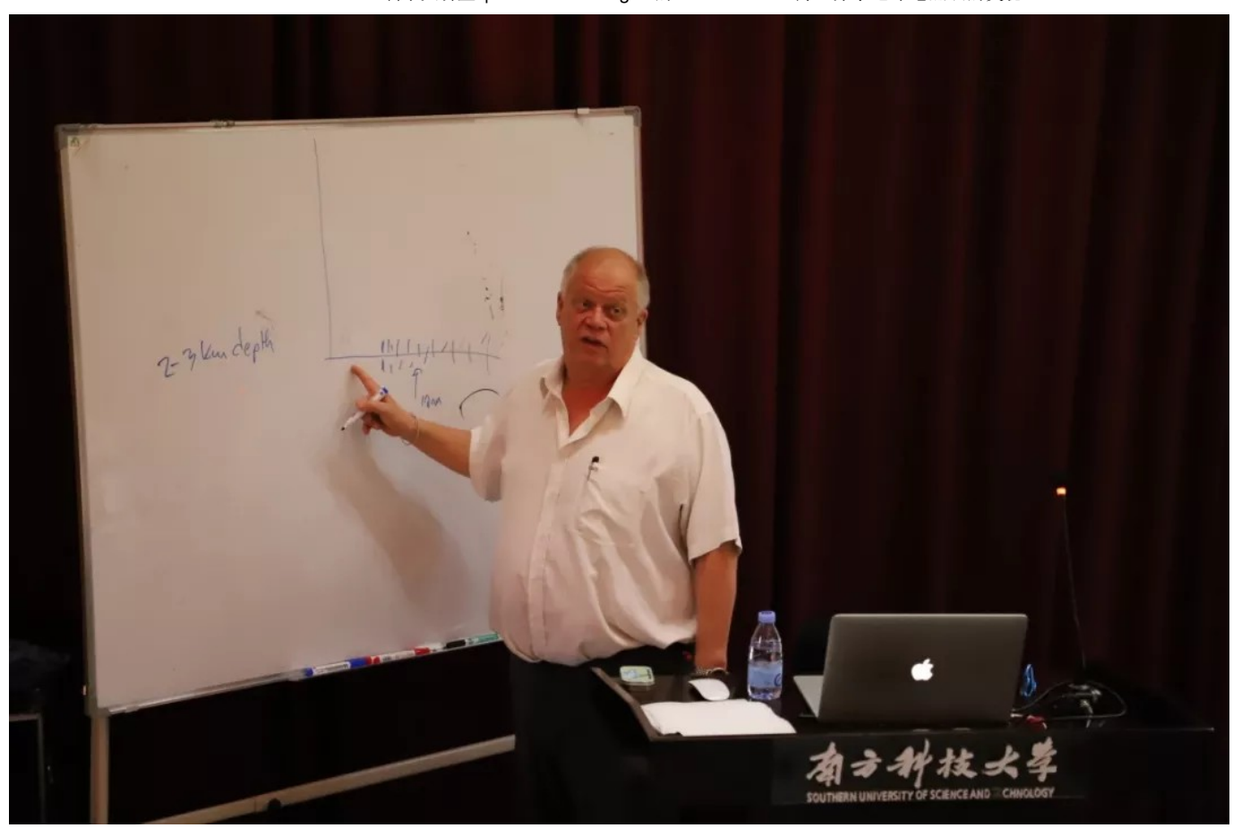
In the lecture

Subsequently, he gave a brief introduction on the research background and some basic geophysical methods , including gravity, magnetics, sound waves and electricity. He also elaborated on its application in the field of hydrocarbon exploration and production , for example, decreasing the risk level of well drilling, discovering residual oil and promoting oil recovery rate, etc.